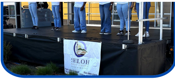
Shiloh Baptist singers entertain the crowd