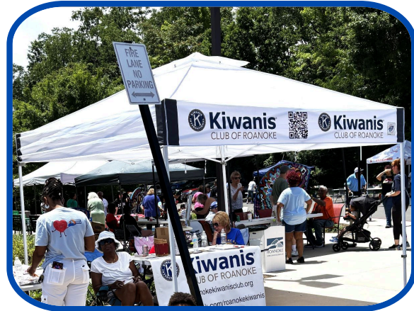
Kiwaniis canopy/booth for Fun Day