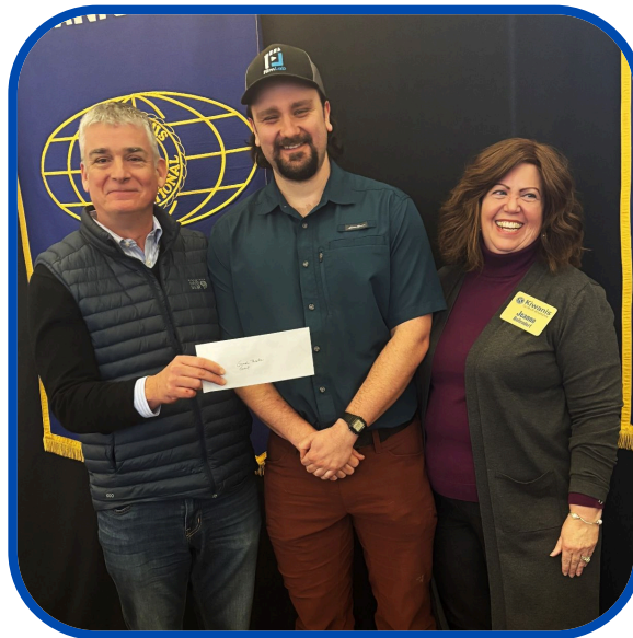
Grandin Theatre Film Lab team accepts Kiwanis grant check