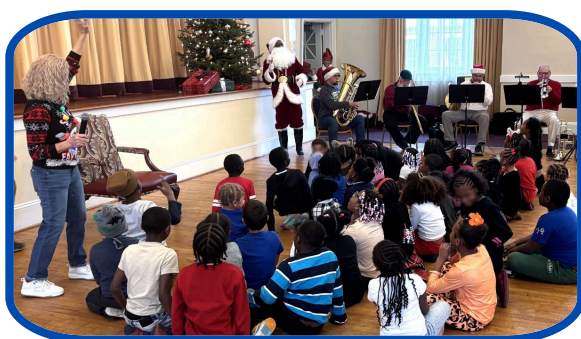
Here comes Santa!