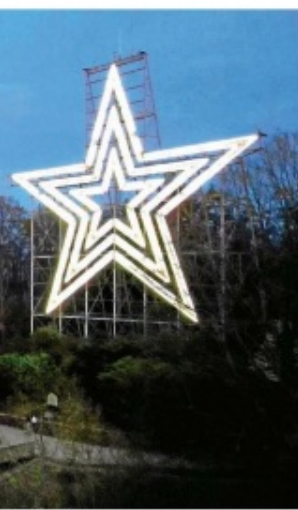
THE ROANOKE TIMES, FILE 2021

The event supports programs that nurture the minds, bodies, and spirits of children in Roanoke's West End. Highlights include: the 5K course through Wasena Park and accompanying greenway; kids activities and bounce house; and costume contest with prizes for the most creative, spooky, or fun outfits; leashed pets; post-race treats and brews for those 21 and older.