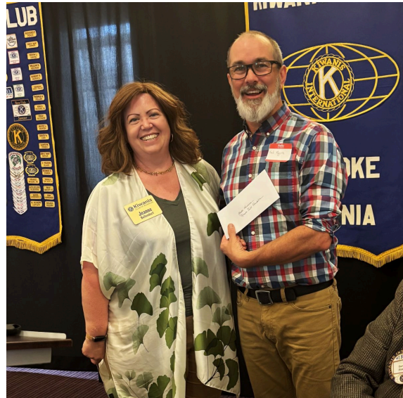
Speaker receives honorarium for Roanoke Parks Foundation