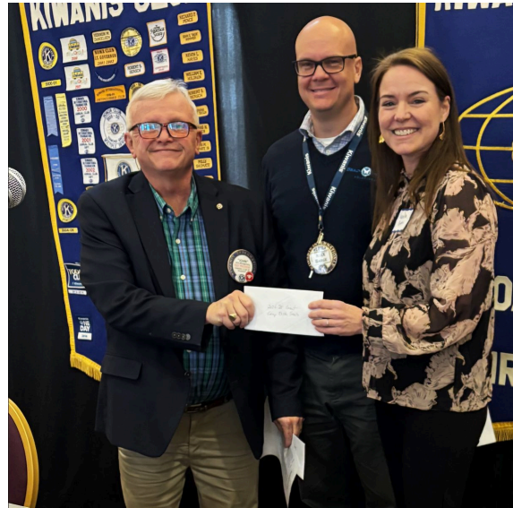
Camp Easter Seals receives Kiwanis grant