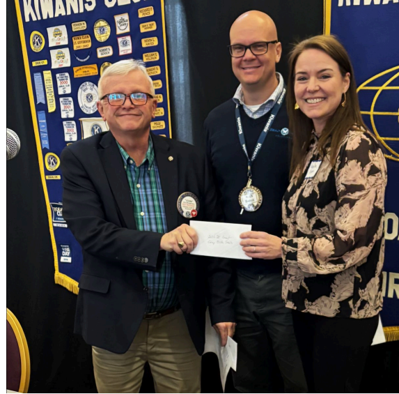
Camp Easter Seals receives Kiwanis grant