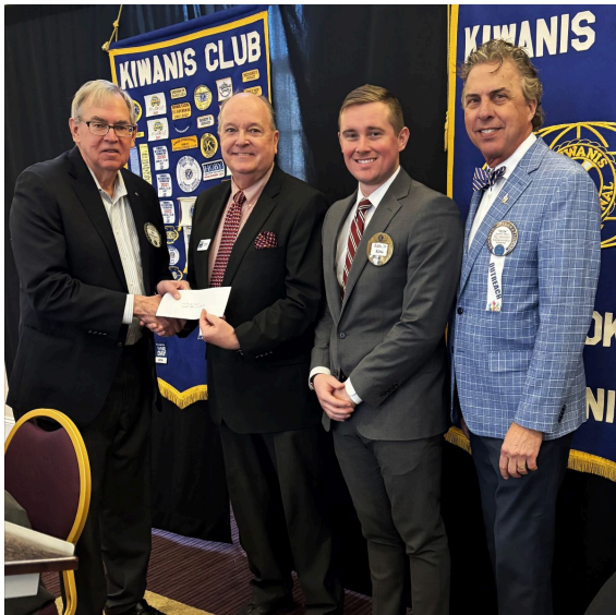
Local Office on Aging receives Kiwanis' largest grant of $9,500