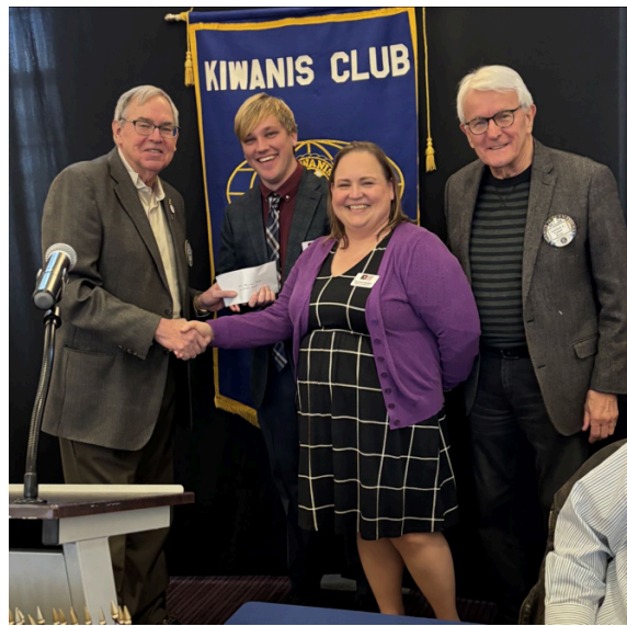
Mill Mountain Theater receives Kiwanis grant