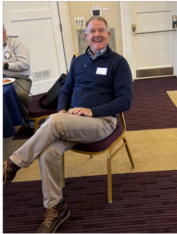
Lt. Governor, Tulane Patterson, enjoys a Roanoke visit