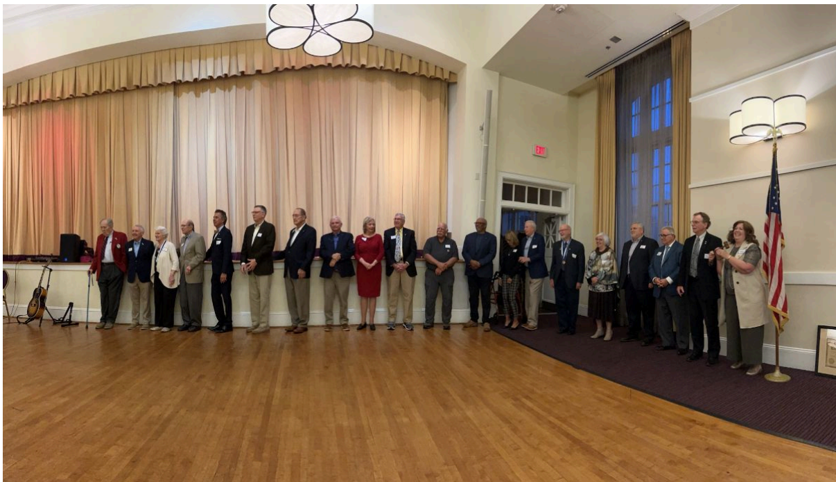
Passing of the gavel from left to right -- and the corresponding years of club presidency: