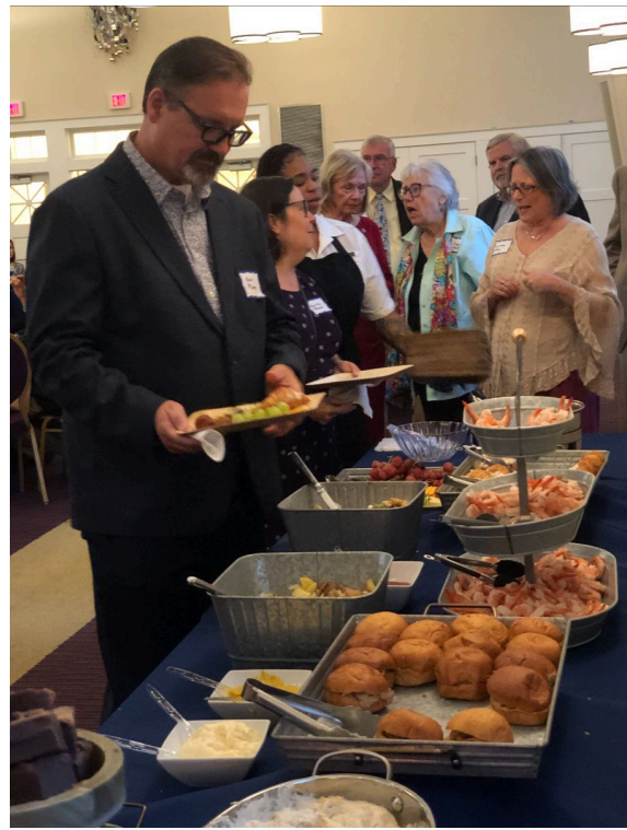
Great food at the buffet line