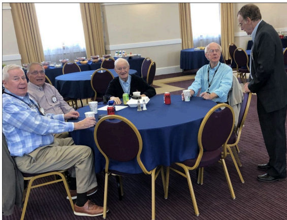
Early birds chat before the meeting starts