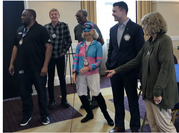
This year's KPAD sales team leaders