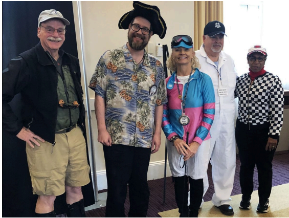
Last year's KPAD sales team leaders