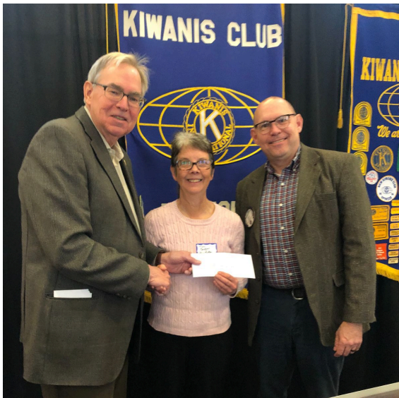
Blue Ridge Conservancy receives Kiwanis grant check