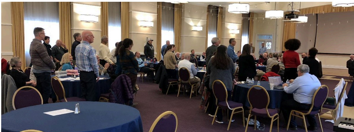
14 guests attended Wednesday's meeting