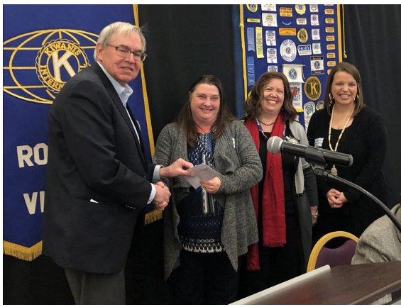
Virginia Children's Theater accepts grant from Kiwanis