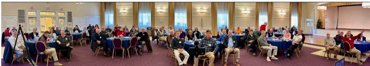
Big Crowd At Meeting