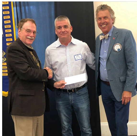
Grandin Theater Foundation grant for student film making