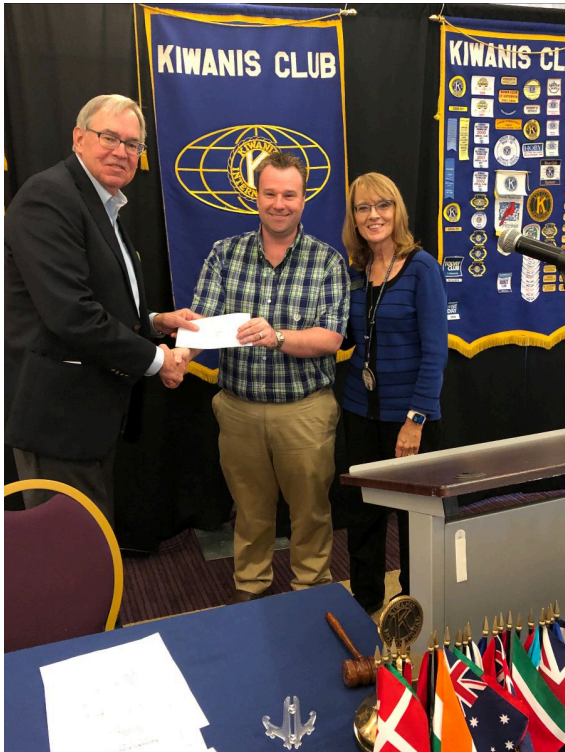
Emanuel Wesleyan receives a Kiwanis grant for feeding school children