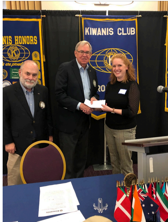
Community Youth Program receives a Kiwanis grant to support youth swimming lessons