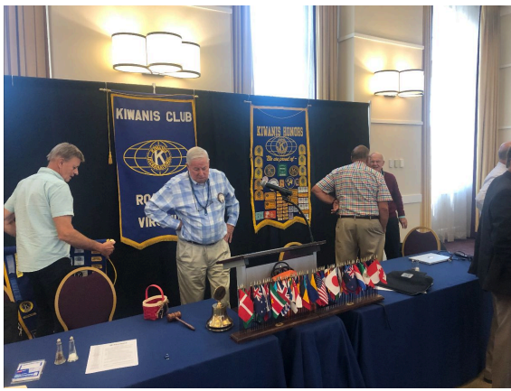
Set-up crew getting ready for the meeting