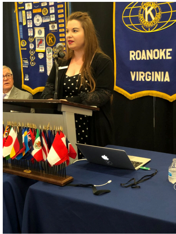
A thank you for Kiwanis CHIP backpack program