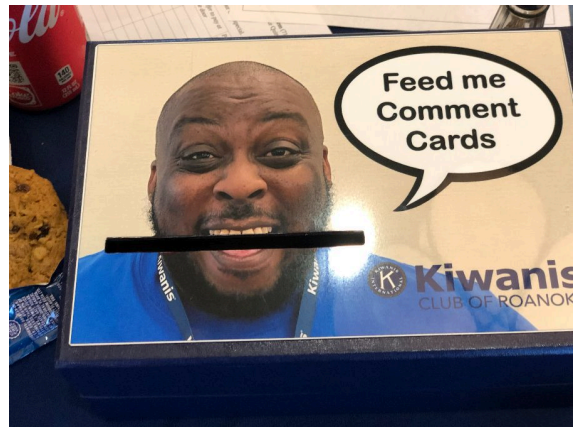
Milton's drop box. Is the mouth big enough?