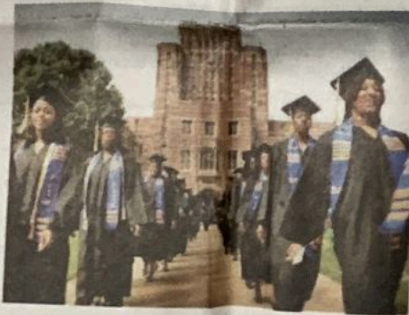
Carolina State, Alcorn University, State University, Central Funding