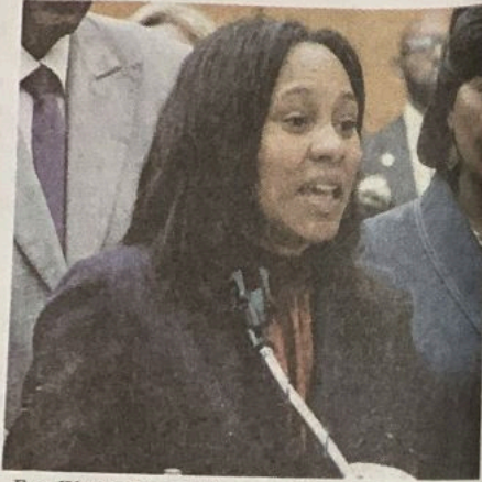
FANI WILLIS, DISTRICT ATTORNEY, FULTON COUNTY, GA

nts outline Trump's fifth indictment across four cases