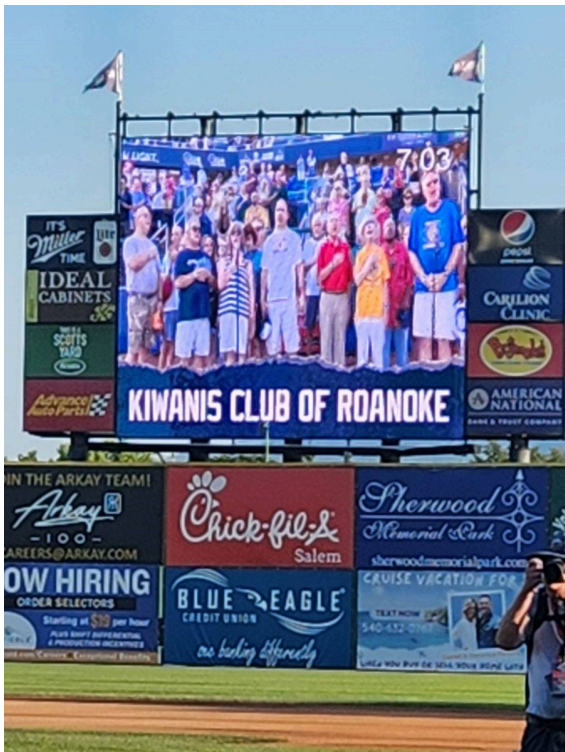
Kiwanis on stadium camera

Below are pictures from the Kiwanis Club singing at the Salem Red Sox game.