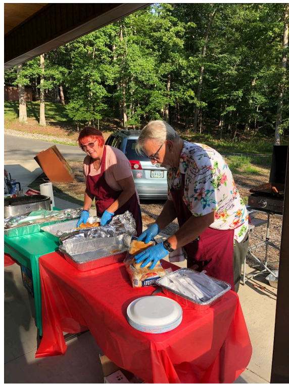
Amy's team preparing to serve