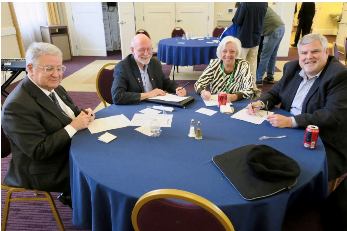
Note that the group of seated people in the above photo are the Nomination Committee working to identify the next round of Board Member and Vice President.