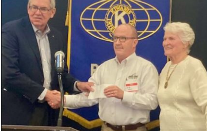
Kiwanis sharing a grant with Straight Street.