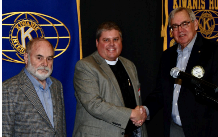
St. John's Episcopal receiving a Kiwanis grant.