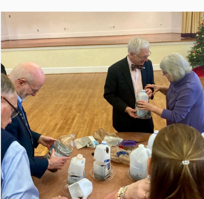
Kiwanians putting together jugs for winter seed sowing.