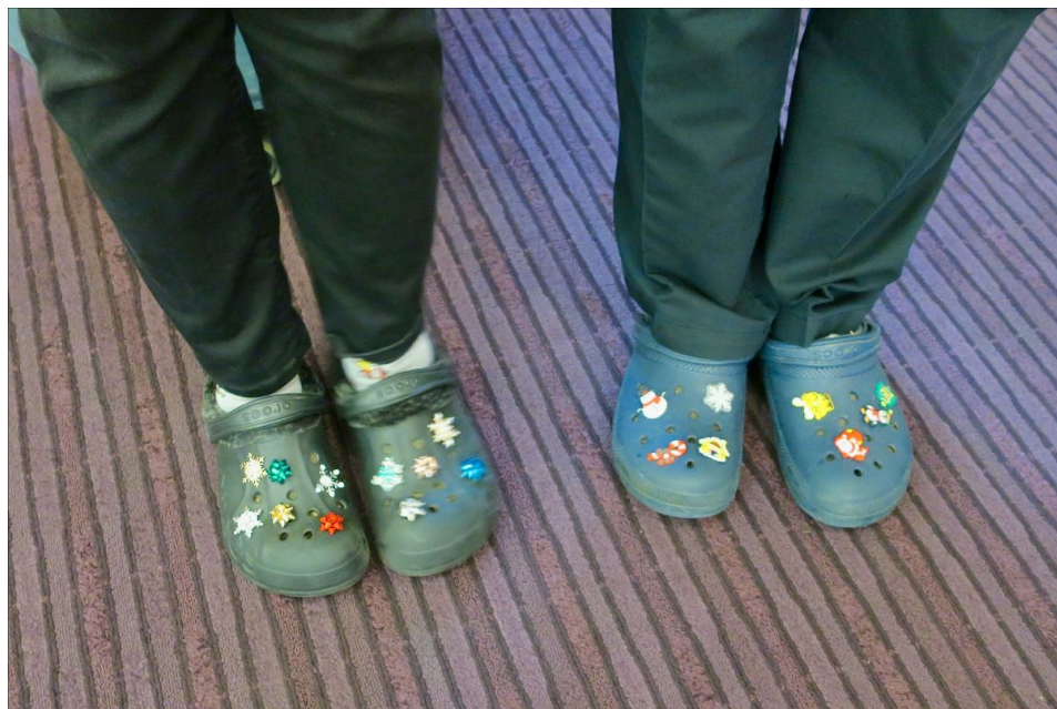
(Above) Festive footwear spotted!