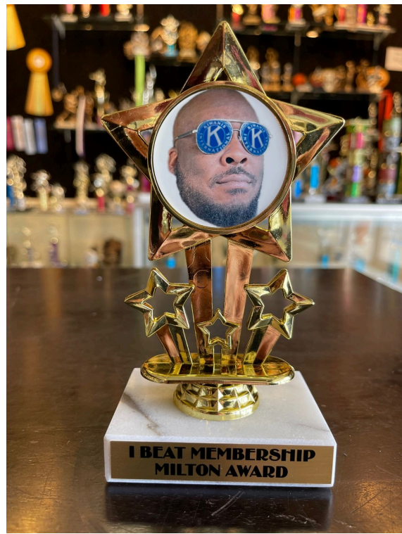
(Above) The "I Beat Membership Milton Award."