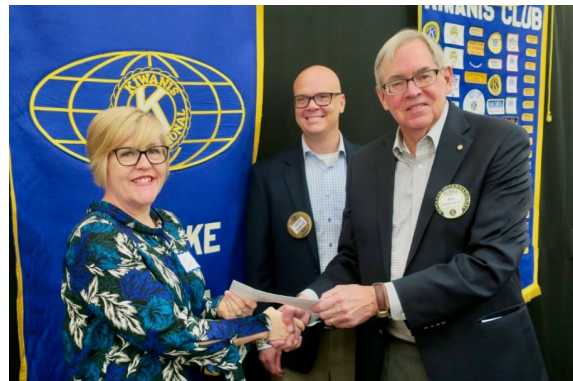
(Above) Brain Injury Services of Southwest Virginia accepting support from Kiwanis as a grant recipient.