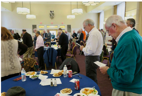
(Above) Members enjoying the meeting.