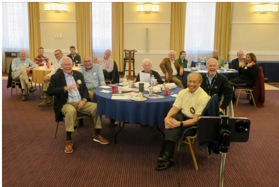
(Above) Members enjoying the meeting.