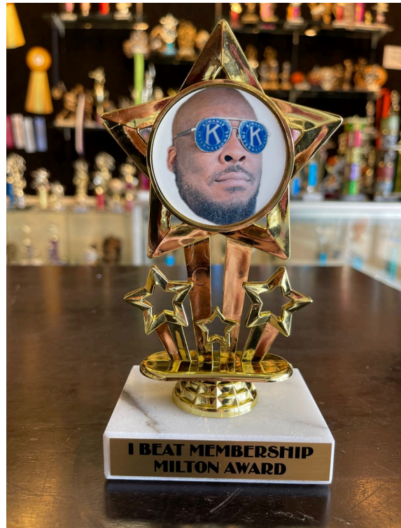
(Above) The "I Beat Membership Milton Award."