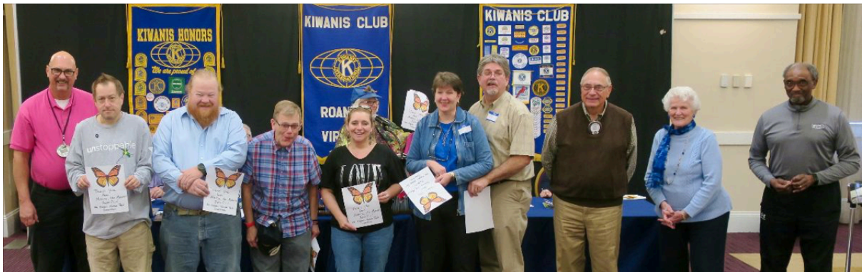
(Above) Volunteers receiving recognition for giving their time and efforts to clean up the Nature Park.