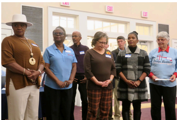
(Above) Bridge Builders' Choir being introduced.