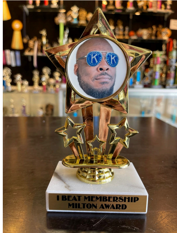
(Above) The "I Beat Membership Milton Award."