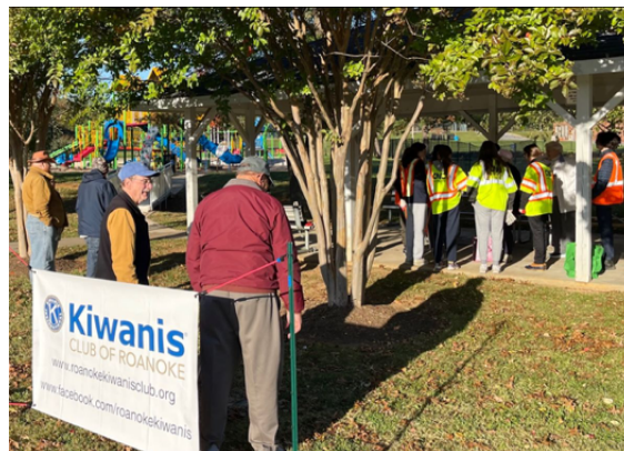
(Above) Kiwanis Clean Up Day