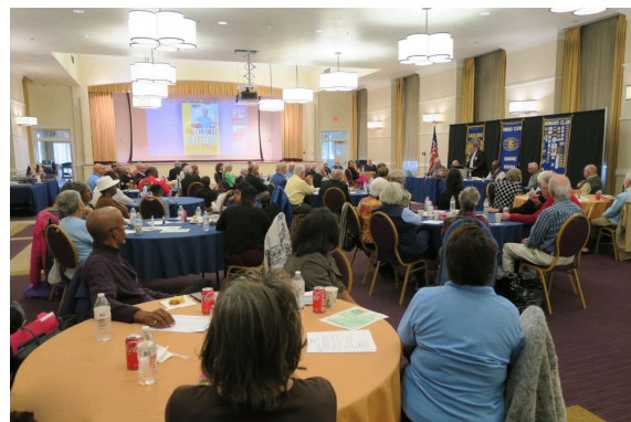
(Above) Members at our meeting listening to a speaker.