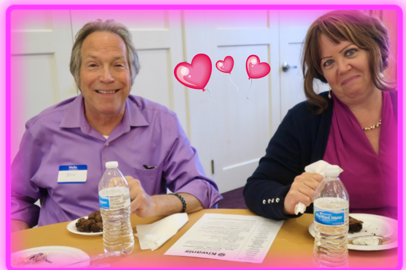
Goofy Lunch Date!