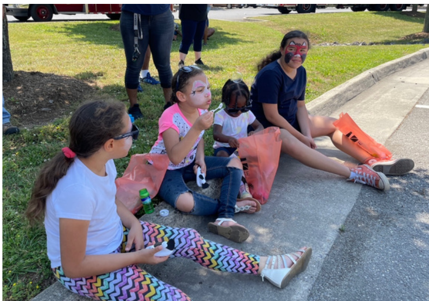
Right - Many faces were painted!